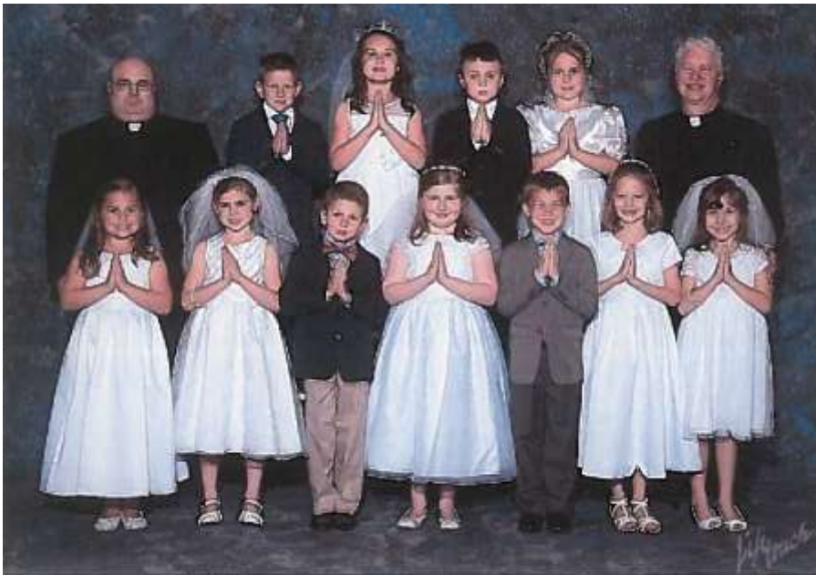
Catholic School Students