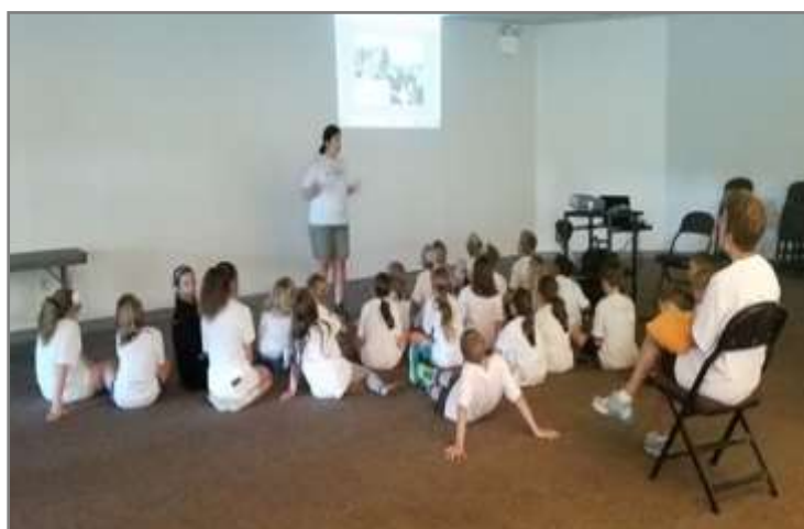
We learned about how we can help others, and participated in a service learning program to provide school materials to the Notre Dame Urban Education Center.