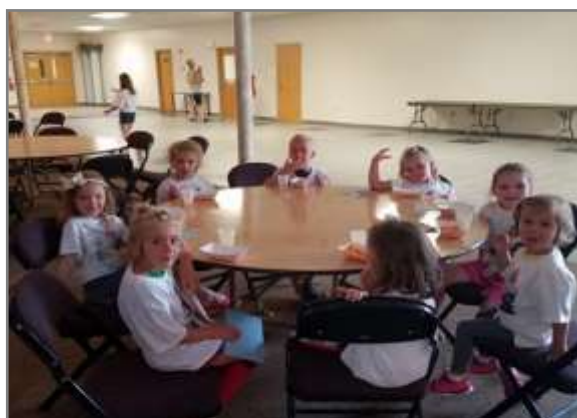
At the end of the week we celebrated with Mass and Dinner together.