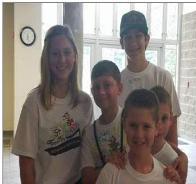
The Snack Crew fed us – and it was Yummy!