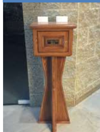
Poor Box for SVDP donations In Gathering Space

We hold most precious your prayers for our success and your gifts of food and donations, whether one time, monthly or in memory of a loved one. Monthly donations have a distinct advantage allowing us to plan our gifting to deserving families. Thank you!