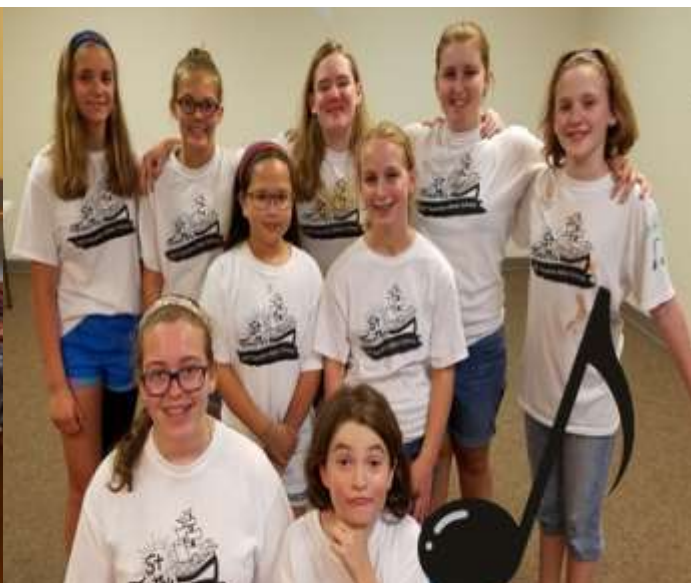
We praised God through song and dance.