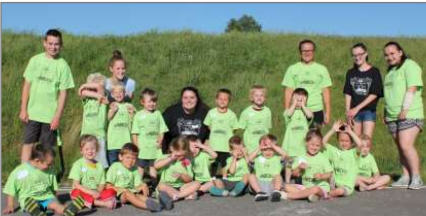
The Lime Green Group