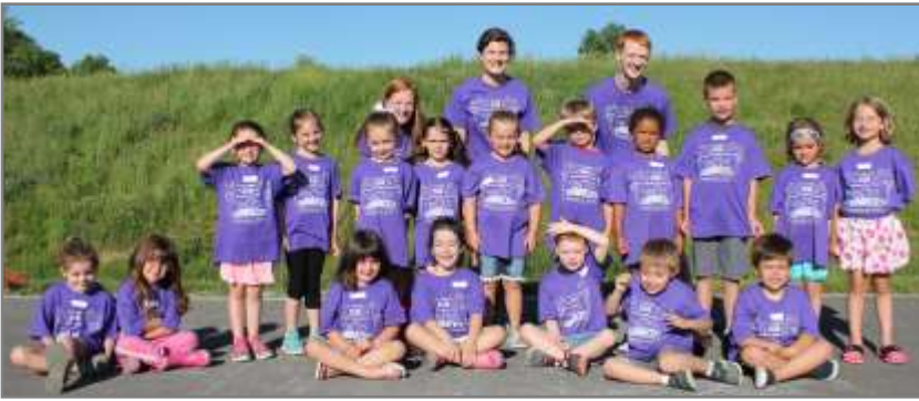
The Purple Group