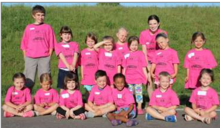
The Sangria Group

Together our Groups learned how Jesus Rescues us every day in every way.