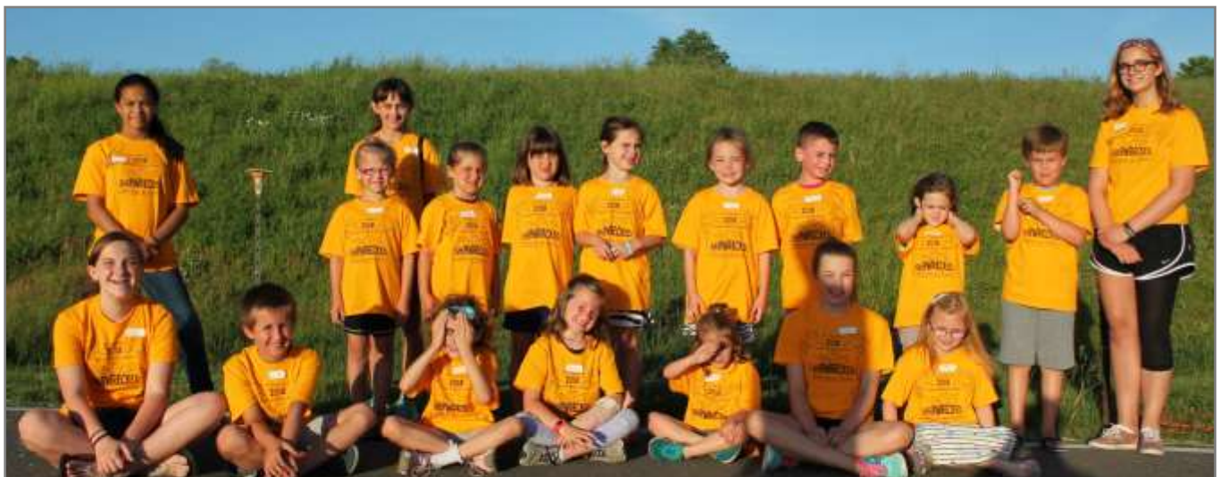
The Gold Group