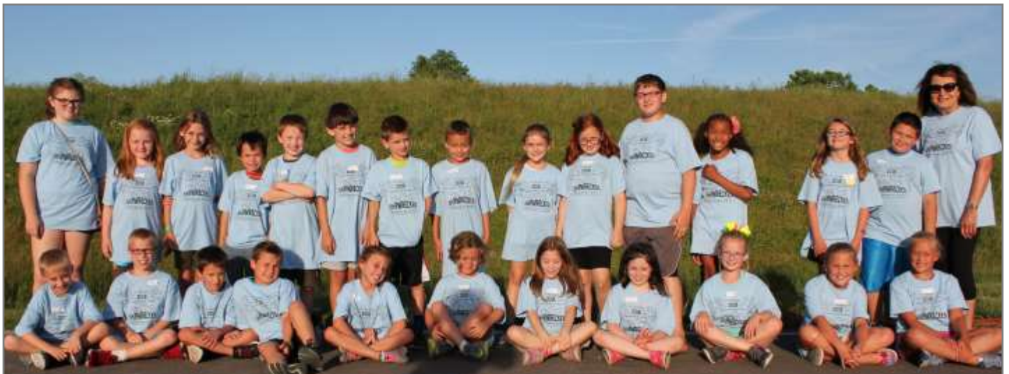
The Sky Blue Group

Our Desert Sand group led the week, serving as greeters, readers,