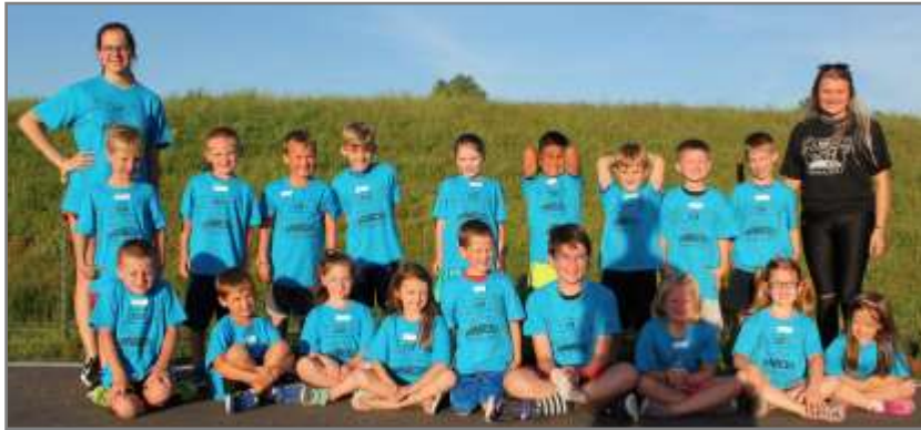
The Sapphire Group