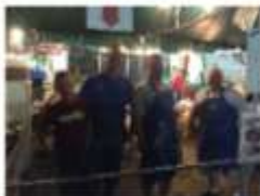
Charity and fundraising events