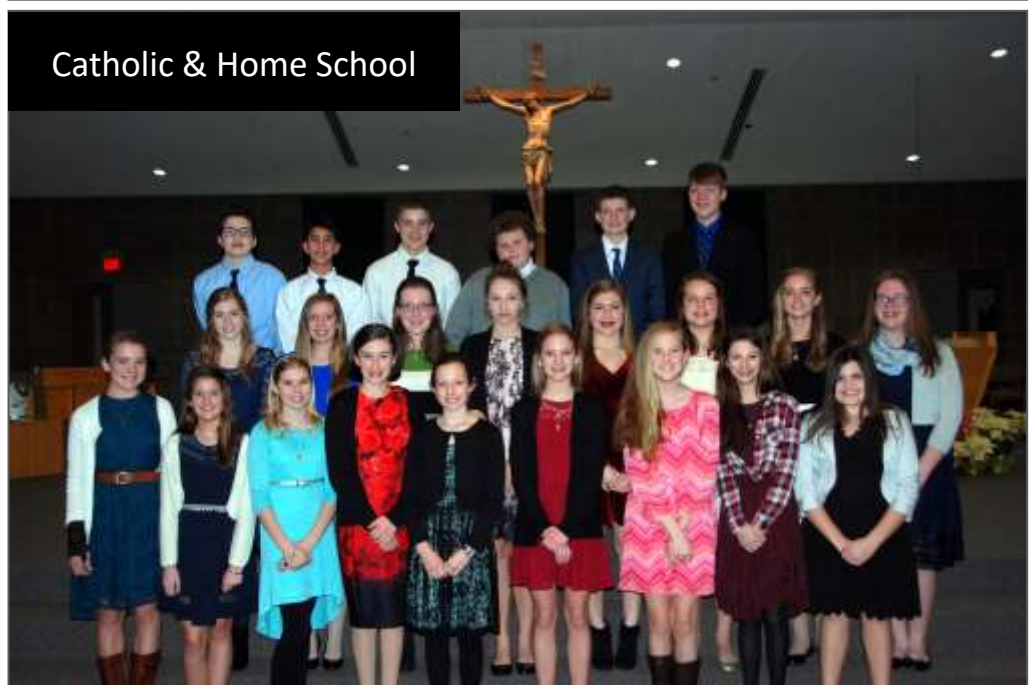
Catholic & Home School