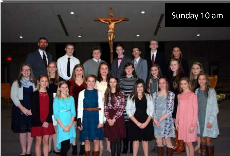
Sunday 10 am