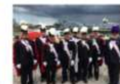
KofC Color Corps

Check out our website and Facebook page for more details at: