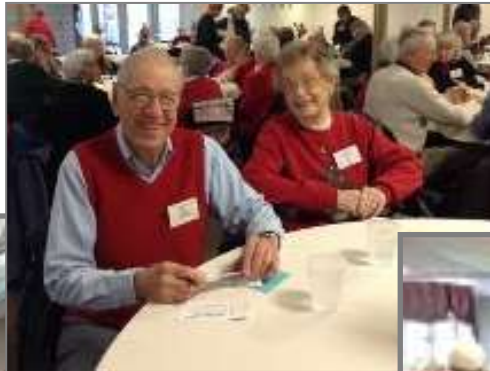
Seniors Christmas Party December 2016