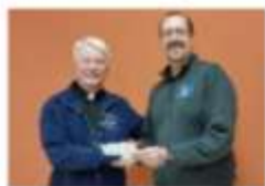
Council financial support to the Parish

The drive will culminate with an information night March 6th at 7pm in Brodnick Hall. Please join us and learn why more than 1.9 million Catholic men have joined the largest Catholic Fraternal Organization, and how you can help us make a difference in our parish and around the world!