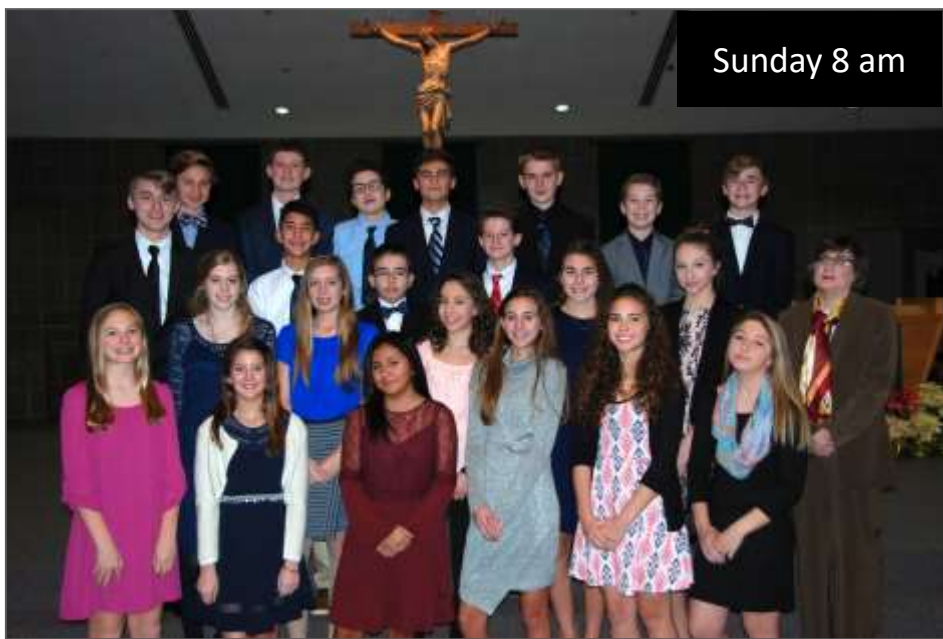
Sunday 8 am