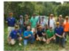
Family and Council events